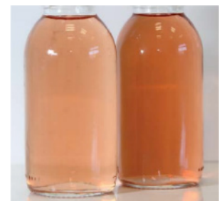
Figure 1: on the left, wine made with oxygen protection during pre-fermentation steps. On the right: wine oxidized during pre-fermentation steps.