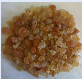
Figure 1: Gum Arabic Pieces

Gum Arabic is a dry exudate derived from Acacia senegal and Acacia seyal bushes in the sub-Saharan that extends from Sudan to Senegal. It is composed of high molecular weight polysaccharides rich in galactose and arabinose and of a small protein fraction, specifically a polypeptide. The exudate, which is produced to repair purposeful cuts to the trunk and branches, is collected, dried, cleaned from impurities and selected according to its color. These gum pieces (Figure 1) are the raw material used to produce gum Arabic intended for use in the food industry.