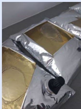
Figure 1: Headspace varies significantly from one BiB to another. This leads to a high variability in quality and shelf life of the wine within the same batch.

BiB bags have a different oxygen permeability depending on the thickness and the materials (PE, PET, EVOH, aluminum