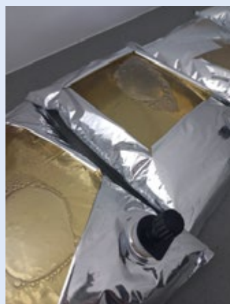
Figure 1: Headspace varies significantly from one BiB to another. This leads to a high variability in quality and shelf life of the wine within the same batch.

Another problem encountered is the high variability of bubble size ( Figure 1 ). By sampling during the same bottling, it is found that the headspace varies significantly from one BiB to another. This leads to a high variability in quality and duration of the wine within the same batch.