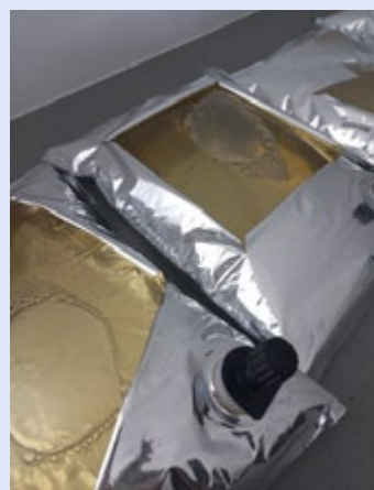
Figure 1: Headspace varies significantly from one BiB to another. This leads to a high variability in quality and shelf life of the wine within the same batch.

Another problem encountered is the high variability of bubble size ( Figure 1 ). By sampling during the same bottling, it is found that the headspace varies significantly from one BiB to another. This leads to a high variability in quality and duration of the wine within the same batch.