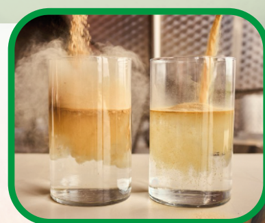
Left: Standard Organic Nutrient; Right: NUTRIFERM AROM PLUS